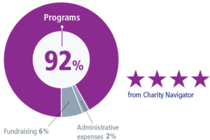
THE ROTARY FOUNDATION'S EXPENDITURES WENT TO ...

Rotary Foundation is our own charity, and every Rotarian is encouraged to donate $100 each year. We know that this can be difficult for people to donate in one lump sum, so we now have the opportunity for each member to pay a little extra on top of their $5 meeting fee each week which will go directly to Foundation in your name. By simply adding $2 or $2.50 each week, you can achieve Centurion status by the end of the Rotary year. Most of us would agree that part of what we love about being a member of Rotary is the opportunity to change lives. Rotary Foundation is how we fund the projects that change lives.