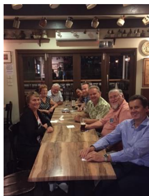
Nice to see so many happy smiles!

Instead of our usual Monday meeting, we had a fun social meeting at The George Harcourt Inn on Tuesday. It was great to get together on a purely social basis, and enjoy each other's' friendship.