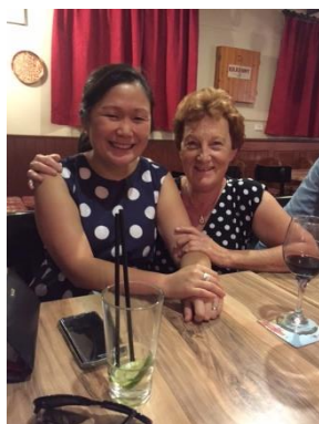
The new club uniform?