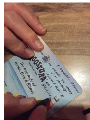
A coaster contract is valid, right?